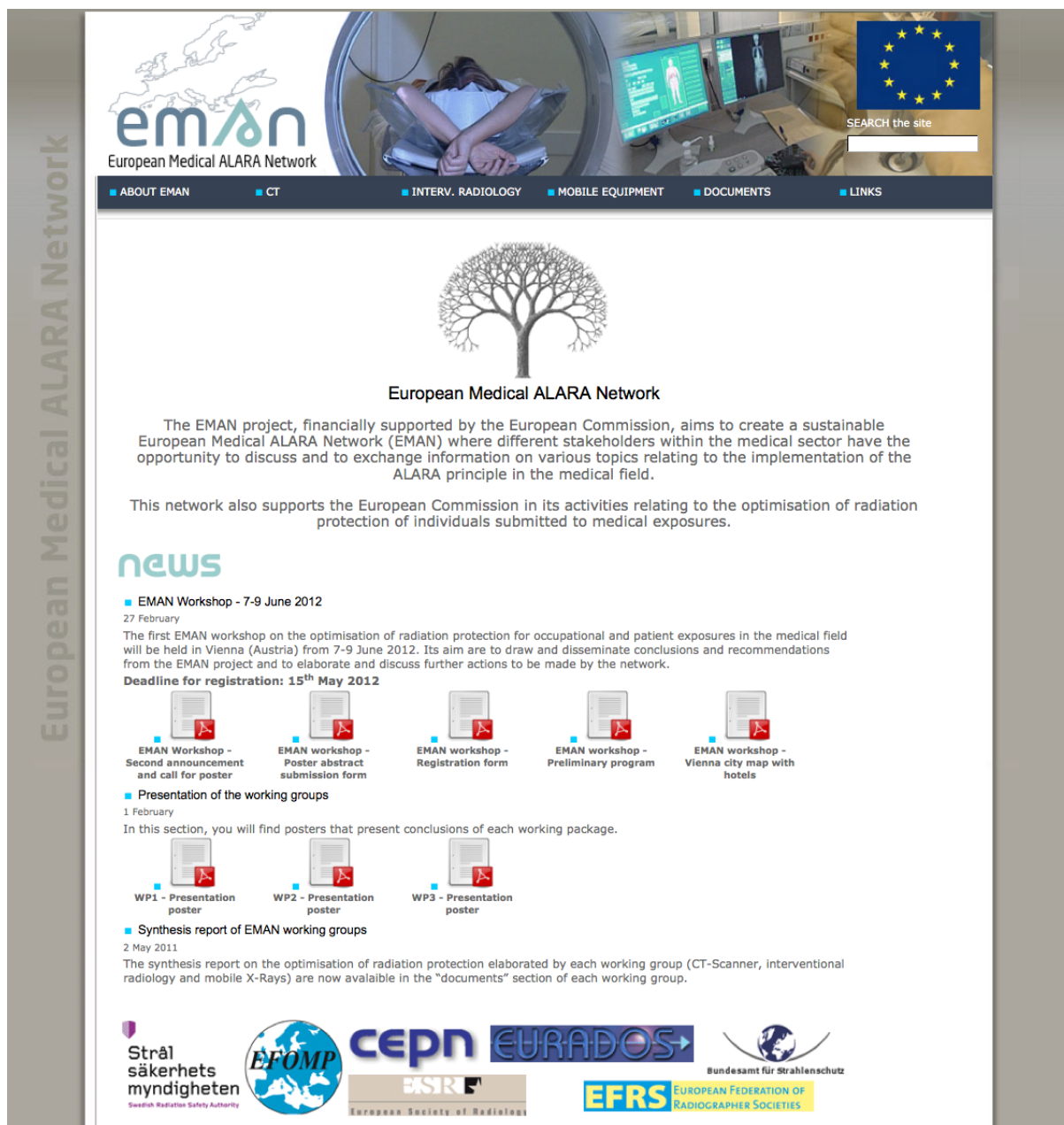
Figure 1 – Home page of the EMAN Web site